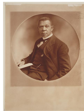
Booker T. Washington's leadership of the National Negro Business League created economic opportunities for the African American community.