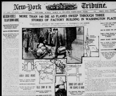
"More than 140 Die..." New-York Tribune , 26 March 1911.

The 1911 Triangle Shirtwaist Factory Fire stands as a watershed moment in U.S. labor history, serving as a catalyst for significant advancements in workers' rights and safety regulations by galvanizing public sentiment, sparking a new wave of activism, and influencing legislative changes that transformed the landscape of the labor movement in the United States.