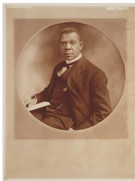
Booker T. Washington c. 1910