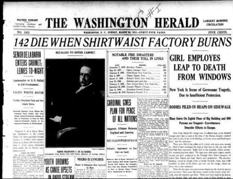
"142 Die When Shirtwaist Factory Burns," The Washington Herald , 26 March 1911, Library of Congress

The 1911 Triangle Shirtwaist Factory Fire stands as a watershed moment in U.S. labor history, serving as a catalyst for significant advancements in workers' rights and safety regulations by galvanizing public sentiment, sparking a new wave of activism, and influencing legislative changes that transformed the landscape of the labor movement in the United States.